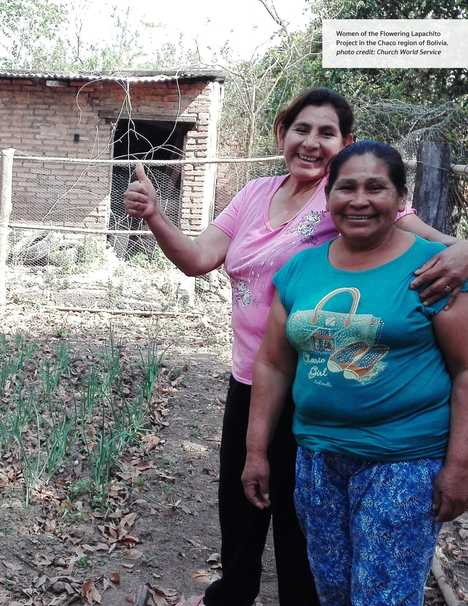
Women of the Flowering Lapachito Project in the Chaco region of Bolivia.