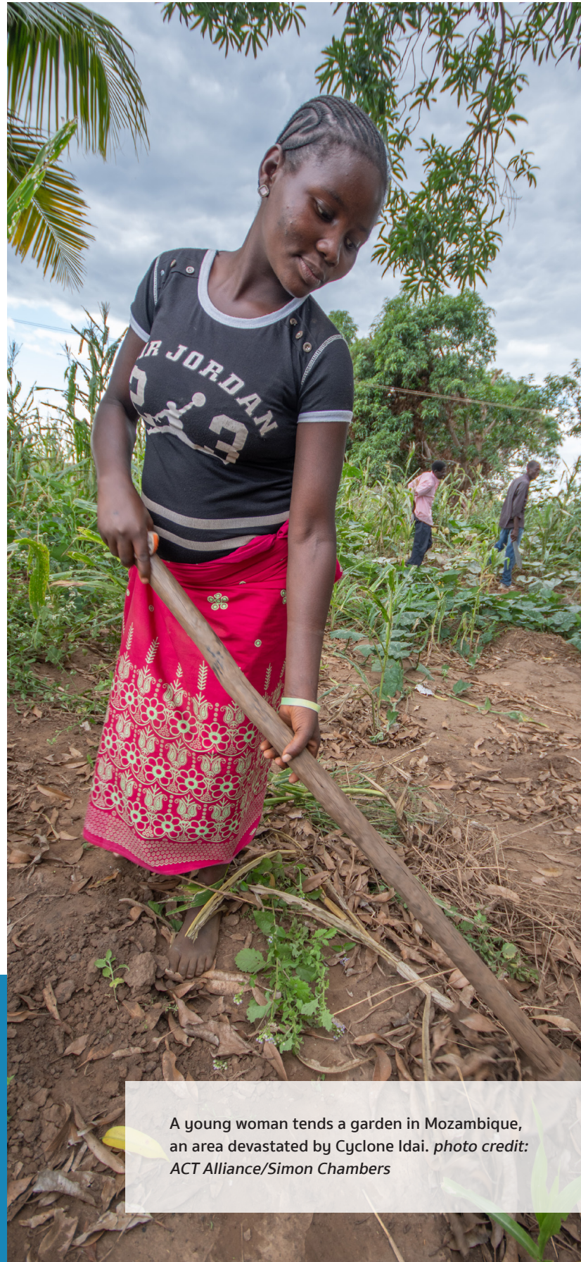
A young woman tends a garden in Mozambique, an area devastated by Cyclone Idai.

For additional online resources including children and youth activities, visit our website, weekofcompassion.org/ special-offering