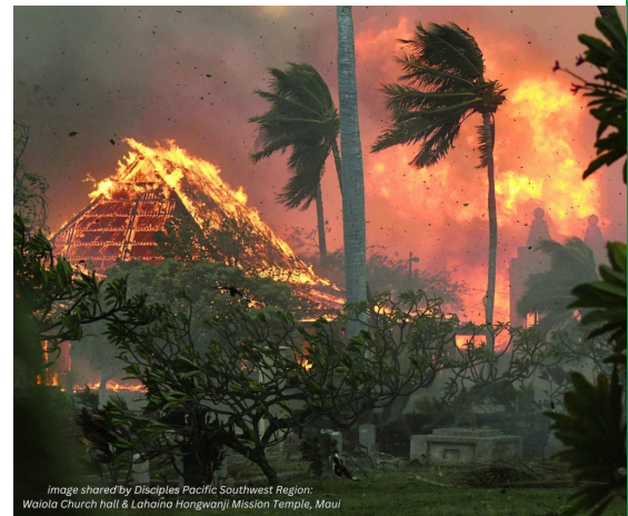
Image shared by Disciples Pacific Southwest Region: Waiola Church hall & Lahaina Hongwanji Mission Temple, Maui

On Tuesday, August 8, gale-force winds rushed along the mountains of Maui, bringing down power lines, igniting grasslands, and contributing to what has become “America’s deadliest wildfire in more than a century”. An extremely dry summer, and winds as a result of Hurricane Dora, exacerbated the flames and the toll on land and people continues to mount.