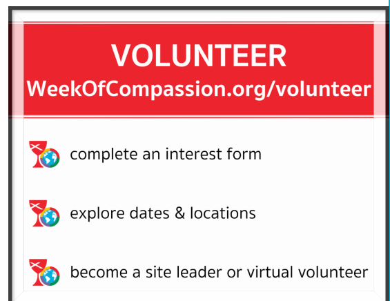
Learn about volunteering with Week of Compassion.

Six months after the hurricane, Christmount's staff still face a daunting task: to both repair the damage of the past and prepare for a brighter future. Week of Compassion remains committed to our Disciples colleagues and their work, and to the far-reaching efforts of