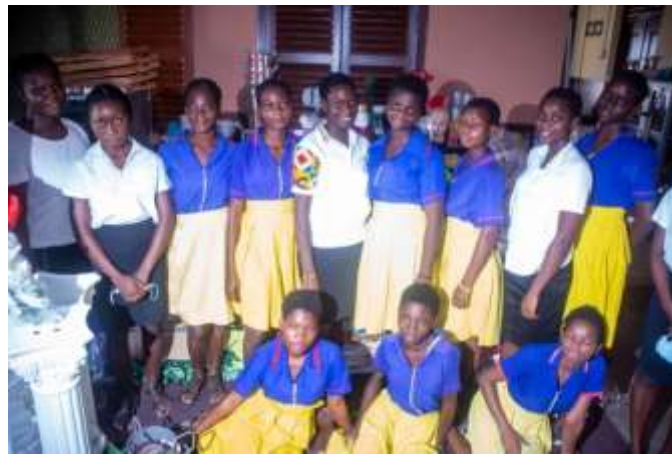
Participants in the Hope for Teens Project