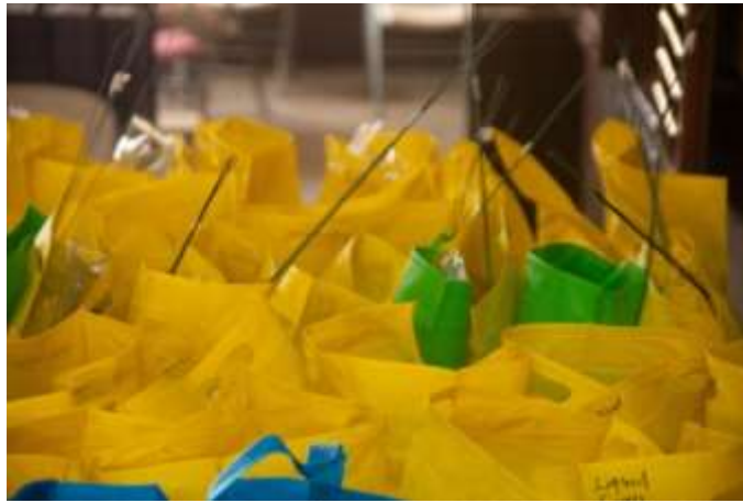
Materials for training session on liquid soap making