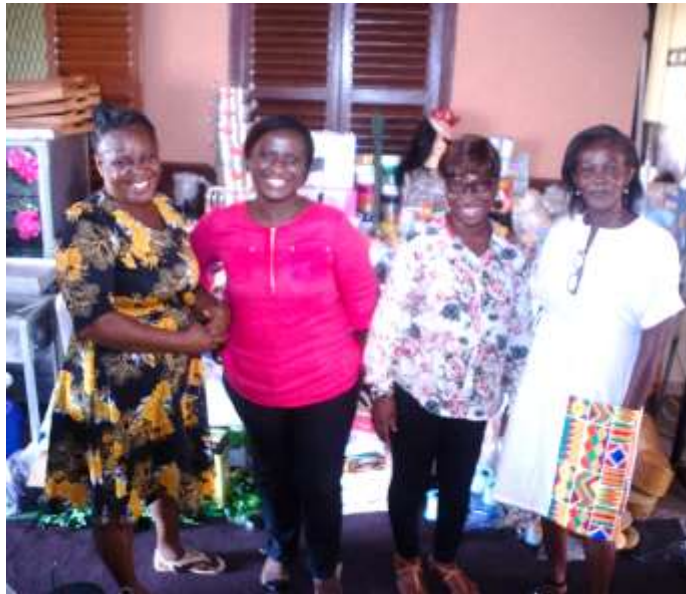
Facilitators of the Hope for Teens Training Project